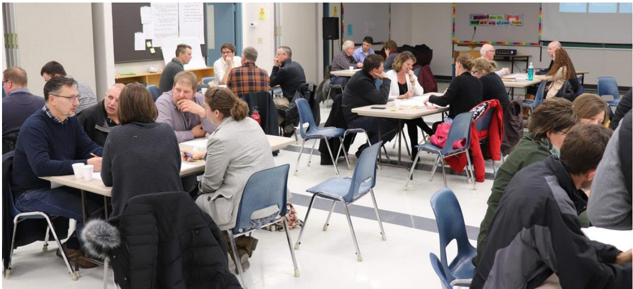
Membership Visioning Evening - January 2019

By 2002, the school had outgrown the church basement, and built a new facility right around the corner at 93 Queen Street in Komoka. Since then, the school has grown, and we now serve approximately 70 families with a school population of approximately 100 students. Our building was expanded in 2018 to add additional classrooms and a learning commons. Today, our families come from a wide geographical area, with families coming from Aylmer, Chatham, Exeter, London, Mitchell, St. Thomas, Strathroy, Woodstock, and Wyoming.