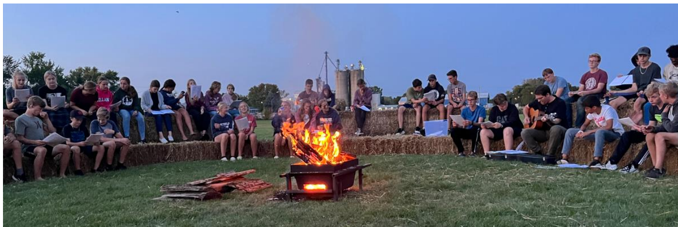
The day began with

Our Fall Retreat is designed to build community, school spirit, and to continue to work out our theme of “Be Ready for Every Good Work.”